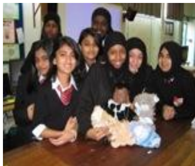
Students from 8BR